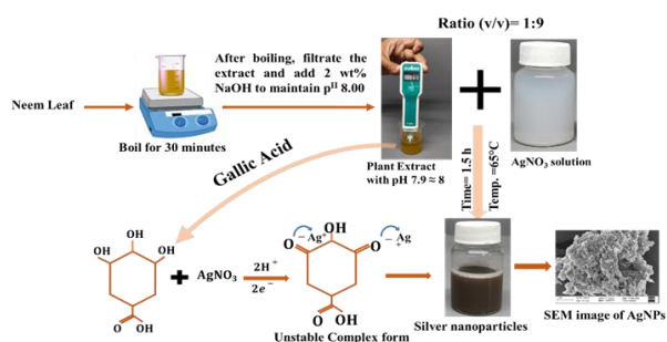
Fig. 1 Overall procedure of preparing A.I-AgNPs with mechanism.

8, as shown in Fig. 1), the hydroxyl groups of these phytochemicals play an important role in the reduction of silver ions into silver nanoparticles. The probable formation mechanism of silver nanoparticles is illustrated here for gallic acids, as demonstrated in Fig. 1. Gallic acids are an excellent free radical scavenger [28], hence it has tendency to release electrons through resonance. During the electron transfer process, an unstable complex medium is formed due to the electrostatic interaction [29] between silver ions and the -OH groups of the phytochemicals. This unstable medium quickly turns into quinoid structure due to the oxidation reaction and leads the reduction of silver ions into silver atoms (nuclei) [30]. This subsequent oxidation and reduction process is known as the nucleation stage. After the nucleation stage, the silver atoms (nuclei) act as a template for crystal growth which finally turns into specific sizes and shapes of nanoparticles (spherical, nanorods, nanowires, etc.) [29]. The quinoid structure attaches to the silver nanoparticles' surface to protect the nanoparticles from further aggregation.