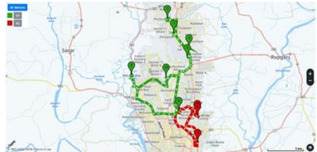
Figure 5: Visualization of Sequencing and Scheduling

The output of the scheduling plan seemed like vehicle-1 started from the depot, served six outlets, and returned to the depot finally in the sequence of depot – outlet 2 – outlet 10 – outlet 5 – outlet 1 – outlet 3 – outlet 4 – depot. For vehicle-2, the sequencing is as follows: depot – outlet 6 – outlet 7 – outlet 9 – outlet 8 – depot. The visualization of scheduling is given below: