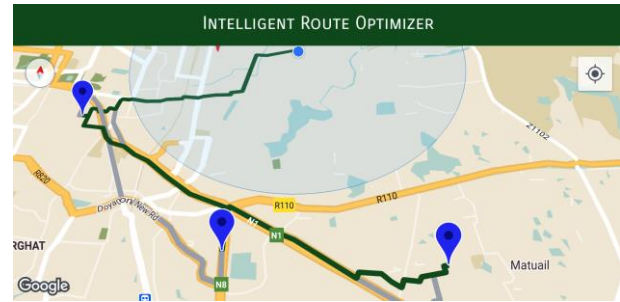
Figure 6: Navigation of vehicle-1 from depot to outlets

The final sample output of navigating vehicle is as follows: