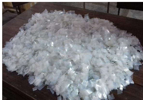
Figure 1 – Feed material for pyrolysis

The layout of the experiment can be seen in Figure 1. The apparatus used in the pyrolysis of wastes plastic consisted of batch reactor made of carbon steel of 8 cm length, 14 cm inside diameter and 28 cm outside diameter. Thermocouple (type K) with digital temperature recorder connected to the reactor of 10 cm deep was used to measure inside temperature of the reactor. The heat was supplied to the reactor by 2 kW external electrical heaters (1.5 kW heater in the bottom of the reactor and 0.5 kW heater surrounding the reactor) to get the required reaction temperature. At the top end of the reactor, a tubing system was connected with two gate valves.