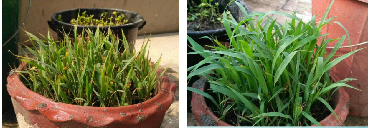
Figure 1: Growth of Napier grass after 8 th and 12 th weeks