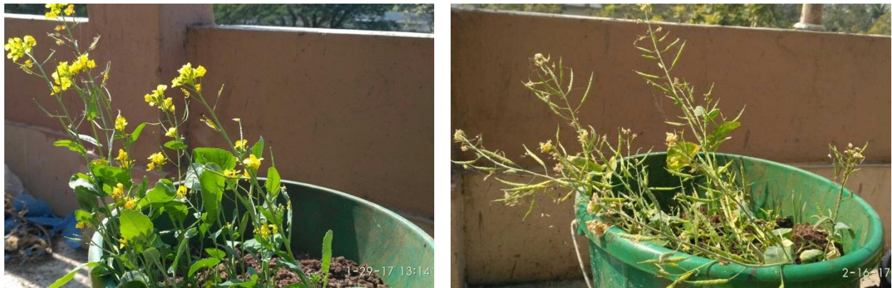
Figure 2: Growth of Indian mustard after 8 th and 12 th weeks